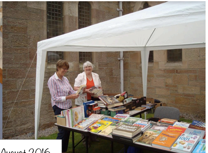
Conon Gala August 2016